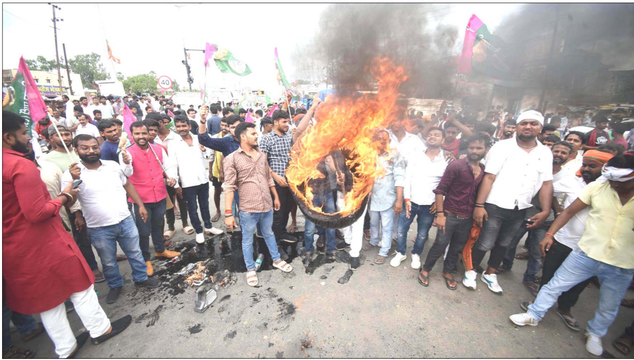
Jan Adhikar Party activists burn a tyre to blocking NH 30 Patna - Gaya road demanding implement Domicile Policy, in Patna on Sunday

The Calcutta High Court has said the panchayat elections and the declaration of results will be subject to its final orders in connection with matters that it is hearing over allegations of electoral malpractices. (PTI)